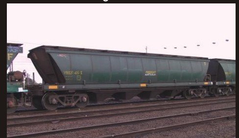
Freight Australia all green VHGF, Prototype Photo Rob O'Regan