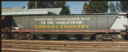
V/Line Sunrice Country VHRF, Prototype