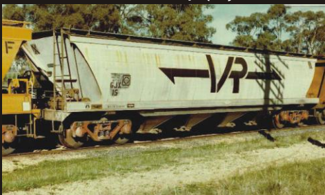
Victorian Railways (VR) GJX, Prototype