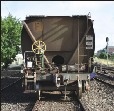
VHGF, Prototype Photo Peter Wilks