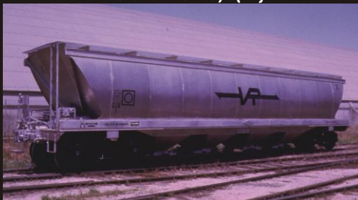
Victorian Railways (VR) GJX, Prototype