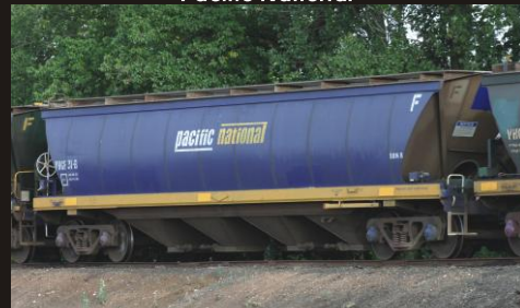
Pacific National VHGF, Prototype