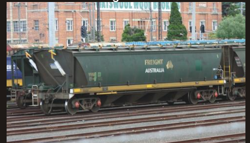
Freight Australia VHGF, Prototype